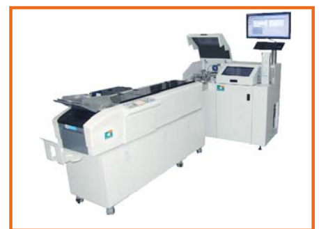
The ImageMaster E-40 works in line with our NBS-1500 Mailing System to create a low-cost issuance & fulfilment system.