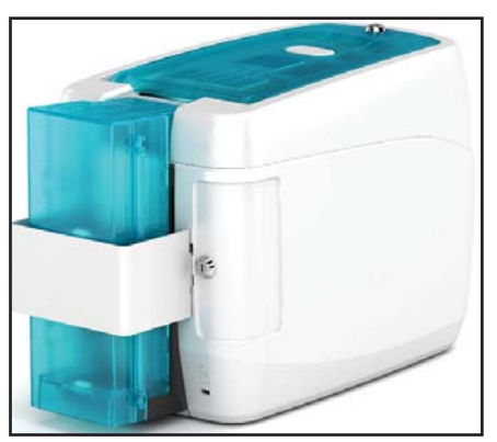
Additional security features and dual hopper option